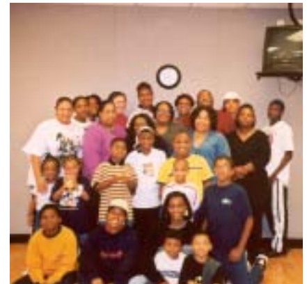
Class 3's Families Fellowship

Class #3 prepared Thanksgiving baskets in November. A turkey was provided to a member of the church, a complete Thanksgiving basket was provided to a family in the community, and Thanksgiving fixings were provided to another family in the community.