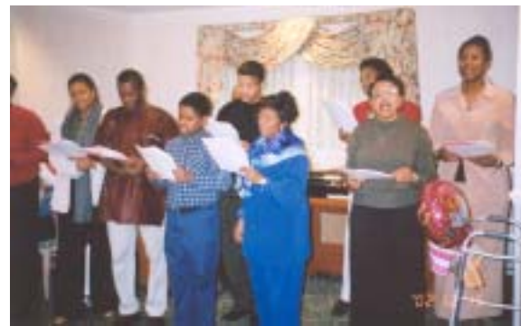
Classes 2 & 3 bring Christmas cheer to Nursing Home residents

During December Class #3, along with Class #2, went caroling at the Montgomery Village Rehabilitation Center. The two classes provided 30 gift baskets to the residents of the nursing home.